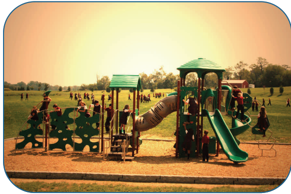
"The Future Starts Today, not Tomorrow" Saint John Paul II